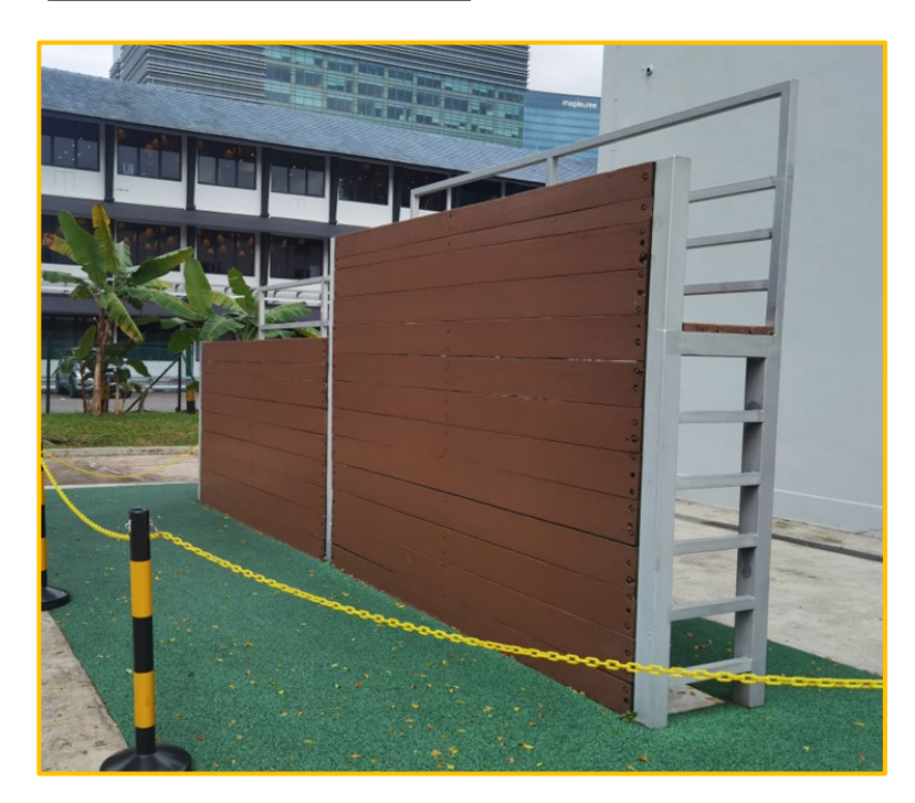
MOE LOALC, 2023