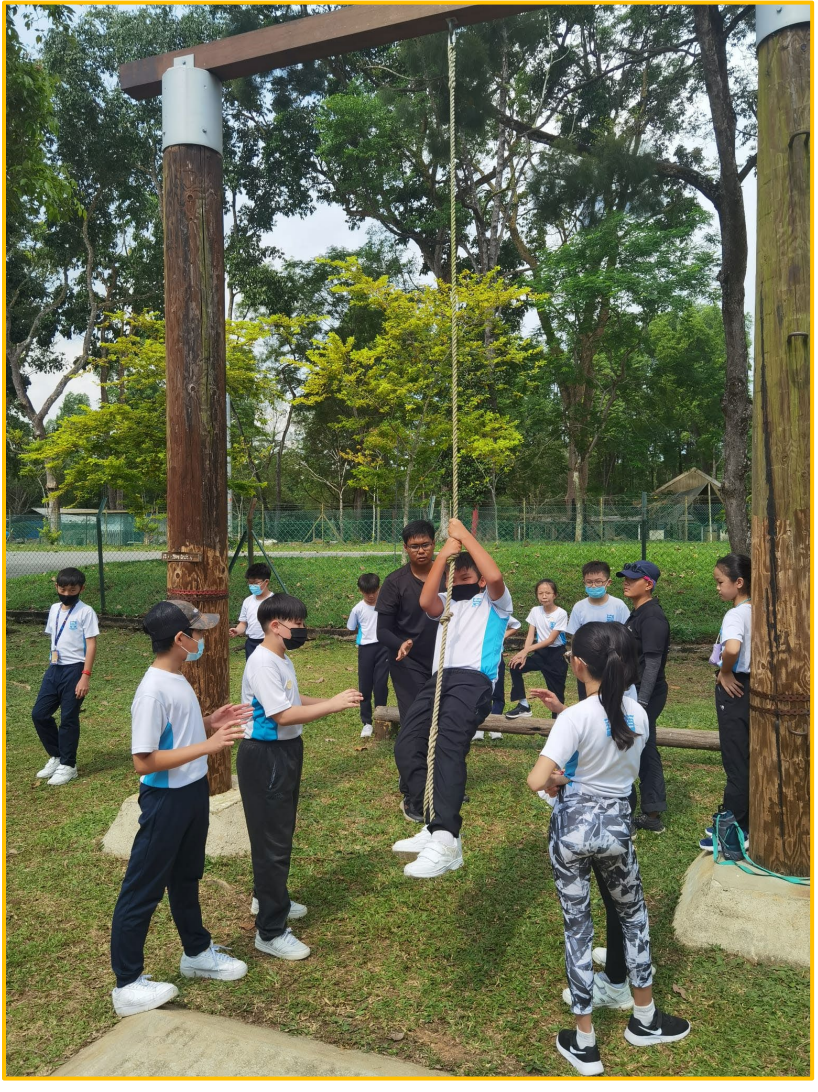
MOE JBOALC, 2022